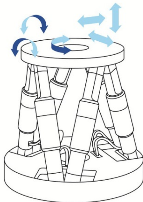
Fig. 2 Basic design: In parallel-kinematic systems, all actuators act directly on the same platform

The repeatability and minimum incremental motion achieves values of below one micrometer. Due to the low mass of the moving platform, Hexapods have considerably shorter settling times than conventional, stacked multi-axis systems. These characteristics can be used in a wide range of applications. Applications range from mechanical engineering and robotics to medical technology, and, in particular, materials research with PETRA-III X-ray radiation which is more powerful and more tightly collimated than the radiation of any other storage-ring-based system in the world. With 14 beamlines and 30 experimental stations, the system therefore provides optimum research capabilities.