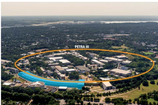
Fig. 1 PETRA III offers scientists from around the world superlative experimentation facilities. In particular, this benefits researchers investigating very small samples or those requiring tightly collimated and very short-wavelength X-rays for their experiments, e.g. in the field of materials research

The high-energy radiation of up to and above 100,000 electron volts with high light intensity offers versatile capabilities, for example in the broad field of materials research for the inspection of welded seams, or for the examination of fatigue symptoms in workpieces. In some cases, this involves accurately positioning really heavy loads down to the micrometer. At the heart of the P07 beamline, which delivers the high-energy X-ray radiation required for materials research, is therefore a heavy-duty Hexapod. Thanks to its accuracy, it facilitates in-situ measurements of material properties under realistic process conditions.