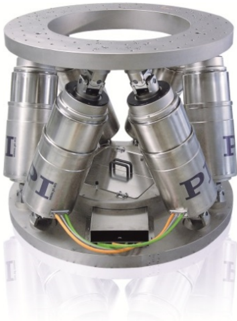
Fig. 5 The parallel-kinematic custom model, the M-850K, delivers positioning down to the micrometer for loads of up to one ton in every orientation

At the heart of the described experimentation chamber is an Hexapod, developed by Physik Instrumente (PI) (Fig. 5).