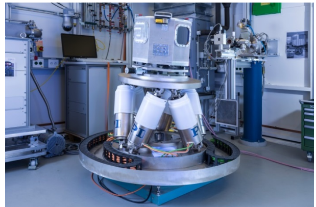
Fig. 7 Hexapod in the experimentation station EH3 on the P07 beam guidance unit on PETRA III: With its high load capacity, it can carry the entire measuring setup including the structure where mechanical forces are applied – in this figure a chamber for the laser-welding of titanium aluminides

The parallel-kinematic custom model, the M-850K (Fig. 7), delivers micrometer-precision positioning for loads of up to one ton in every orientation. It stands approx. 700 mm high and has a diameter of 800 mm (top platform with large aperture) and/or 900 mm (bottom). The lower platform is installed on a 360° rotation table and the cabling was designed to be dragchain compatible.